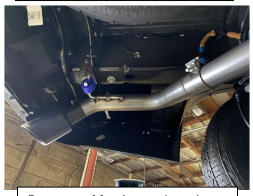
5. Install the exit pipe onto the over axle pipe and insert into rubber hangers. With exhaust loose make adjustments to find the proper tip position and clearance from all vehicle's components.