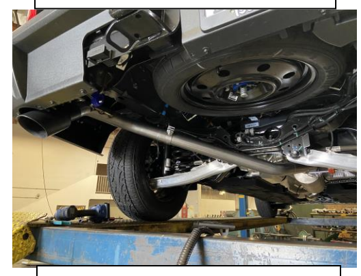
6. With proper clearance from spare tire, install the exhaust tip onto the tailpipe. The system was designed to have the tip 1" below the bumper panel of the vehicle. With the tip in your desired position begin to tighten down all clamp connections from the front head pipe back.