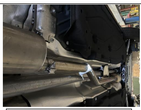
3. Install Head pipe Item # A onto the factory pipe. Slide the muffler onto item # A. Be sure to mark all slip connections 3.0" to help determine the pipe position. Loosely tighten down.