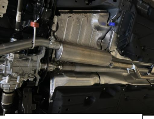
4. Install the over axle pipe into the muffler. Loosely tighten down.